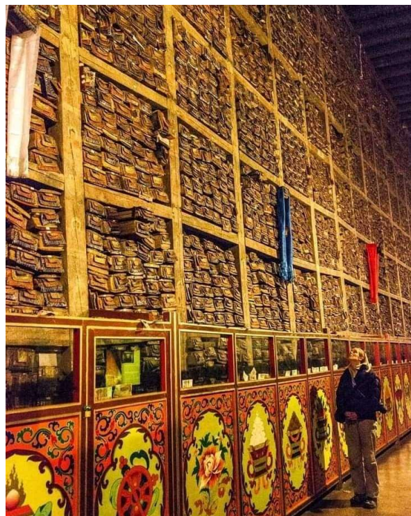
Sakya Monastery houses 84,000 manuscripts

Further trip notes including a Checklist of essential clothing and equipment to take, health considerations, visa formalities, etc, will be sent upon receipt of a completed Booking Form and deposit. Please contact our office any time for further information via email: Adventure@WorldOnWheels.Tours